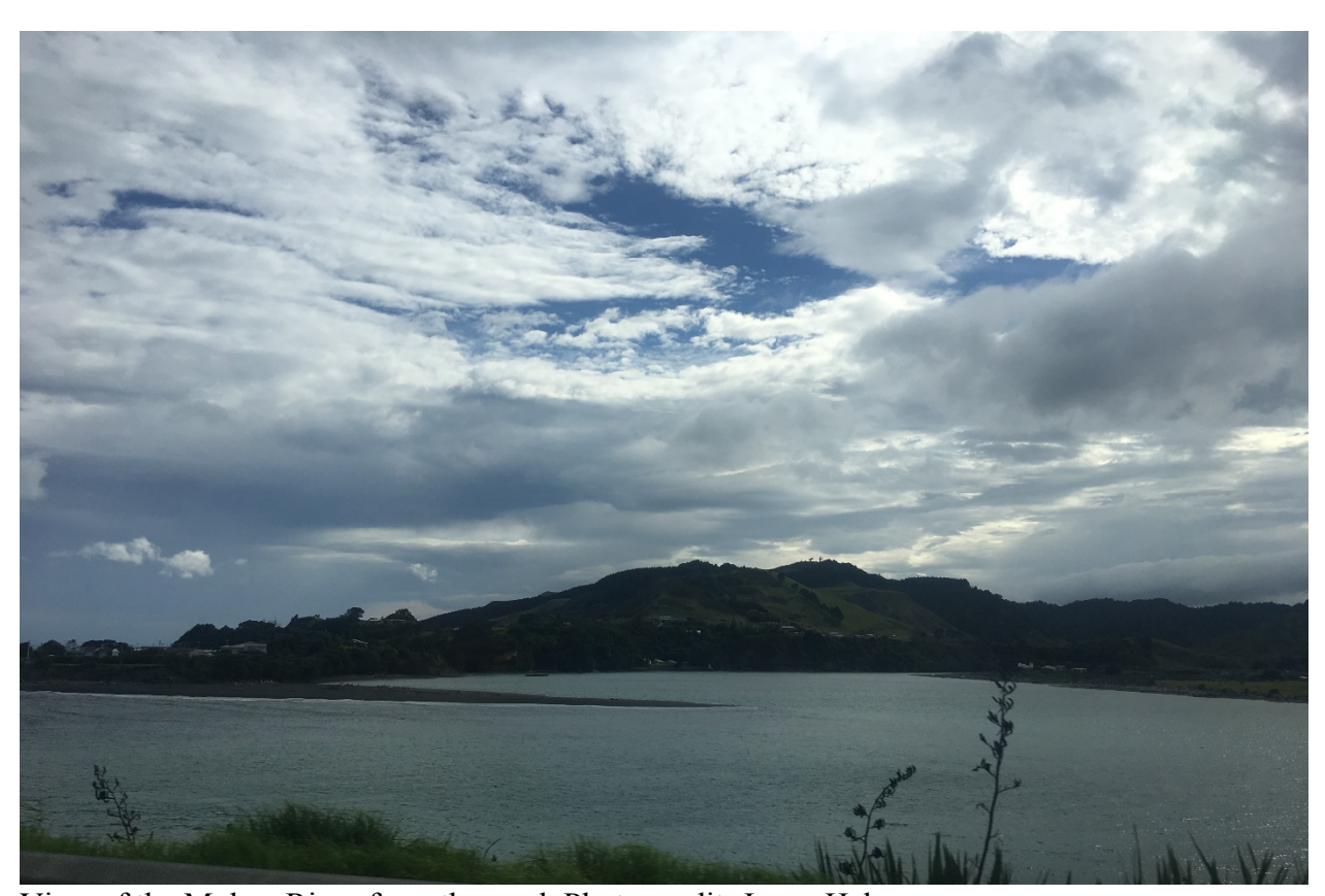
View of the Mokau River from the road.

As the trip was beginning to come to a close, and having checked off all of the large items on the itinerary, everyone seemed to be in a mode of reflection. We (in our van, anyway) were beginning to ponder what we might focus our final project presentations on upon returning to school, collaborating photo-sharing, and reliving all of the many memories made over the past week—of both a personal and an educational nature. One thing each of us could agree upon was that our time here seemed to end almost as fast as it had begun, but it certainly would not be so quickly forgotten.