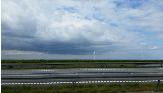
View of windmills from the van