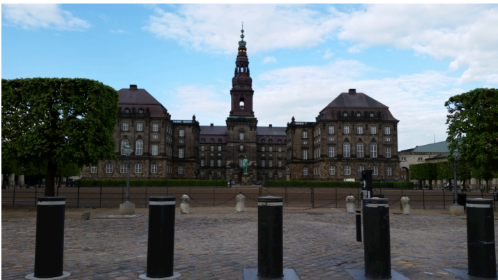
Christiansburg's Palace that offered fantastic views of the